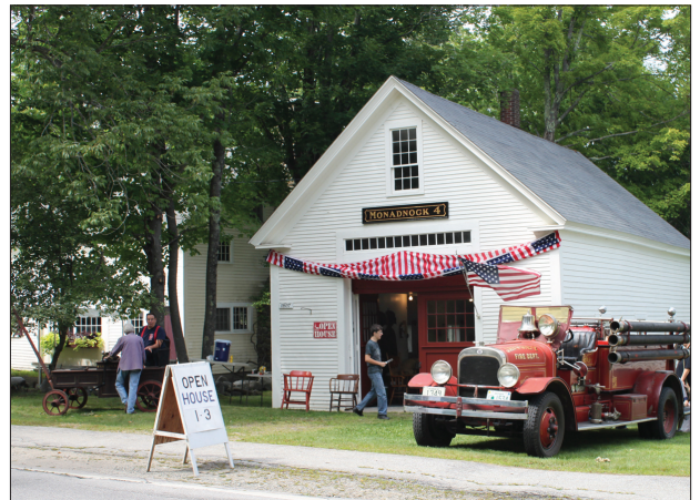
Open House on August 16th at Monadnock 4 , the Society's Fire Museum in Jaffrey Center. The new Fire Museum brochure was launched and hot dogs served.