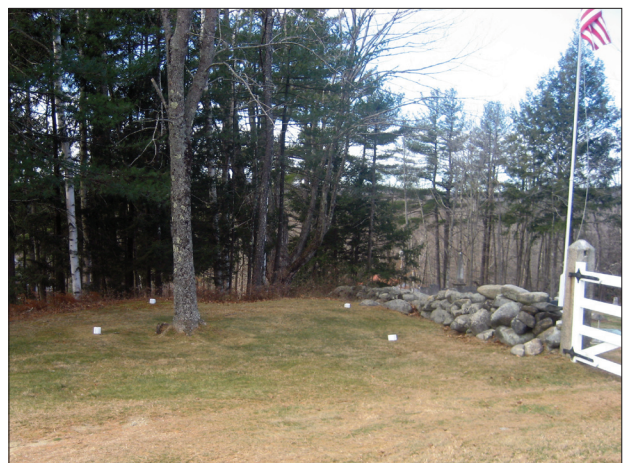
The white markers indicate the proposed location for the Hearse House outside the Old Burying Ground. If all goes well, it should be up in 2015.