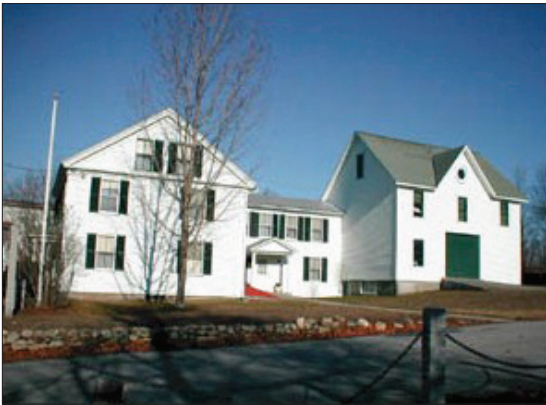
Carey House—the home of the Milford Historical Society and one of our destinations on our Annual Autumn Outing.