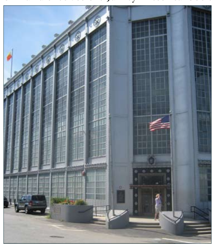
The distinctive art-deco facade of the Higgins Armory Museum.

We'll plan to arrive at the Museum by 2:15. There will be a presentation at 2:30 then we'll be on our own until closing time at 4 pm (gift shop open to 4:30 pm in case you want to buy full body armor). Reservations are necessary. The cost will be $5 per person (the Society will pick up the remaining $2 of the $7 group rate). You can pay on the day itself or mail a check to the Jaffrey Historical Society, 40 Main Street, Jaffrey, NH 03452. <u>In any</u>