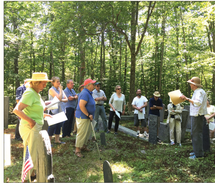
A good crowd convened for a tour of the Phillips-Heil Cemetery on Sunday, June 17th. It was co-sponsored with the Jaffret Cemetery Committee.