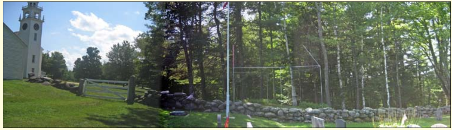
A view from the Old Burying Ground looking south with the Meetinghouse on the left and the tubular steel mock-up of the proposed Hearse House at center right. (It was moved to the west 15 feet following the Charrette on August 23rd.)