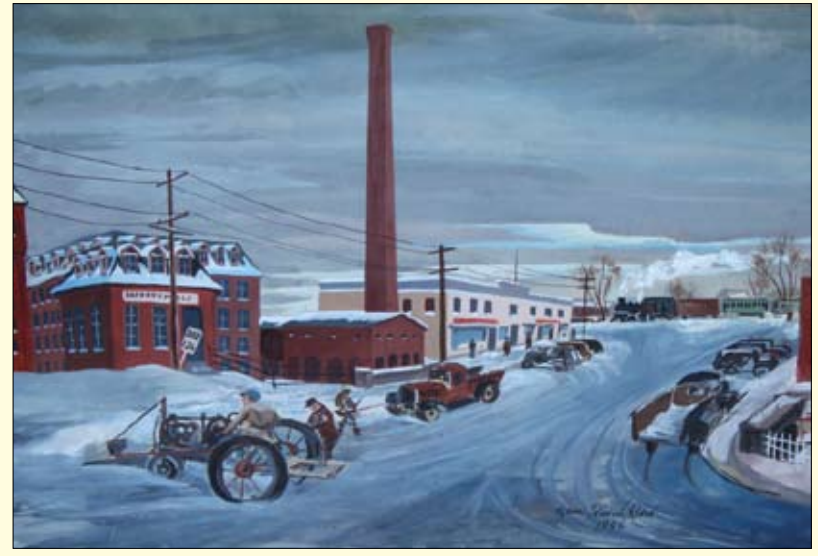
See above to learn more about this painting.