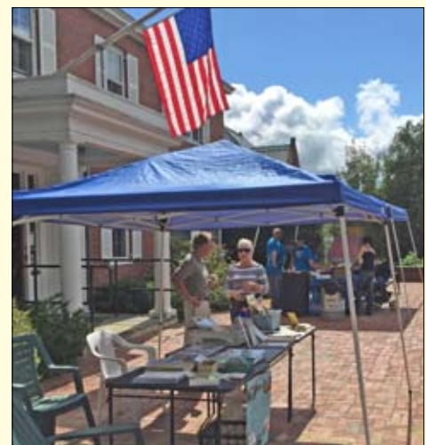
The Society's table on the front patio of the Civic Center at the annual Riverfest on July 25th.