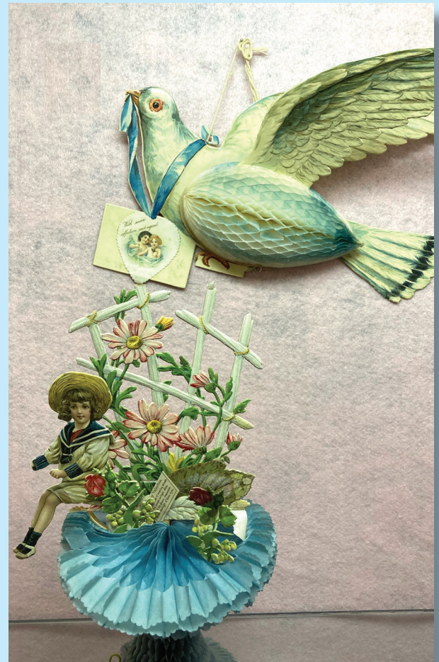
Antique Valentines at the Civic Center. 🐾