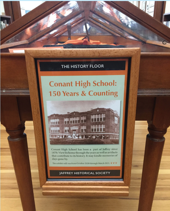
The poster highlighting the exhibit the Society staged at the Jaffrey Public Library. It's still there and the History Floor is now open so drop by and have a look or go to https://rs41.smugmug.com/Jaffrey/JHS/Civic-Center-JHS-Display-Cases/i-KqM4Qhh . 🐼