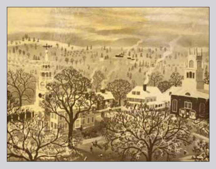
A winter scene in Jaffrey Center with the Meetinghouse and the Brick Church. The date and artist are unknown. ♥