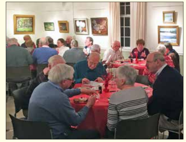
Working hard on the Quiz at the February Pot Luck.

PS: If you received a membership envelope with this newsletter it means that your dues have yet to be paid. Please renew your membership! The Society relies 100% on dues to cover its annual expenses—no fundraisers! So please be generous.