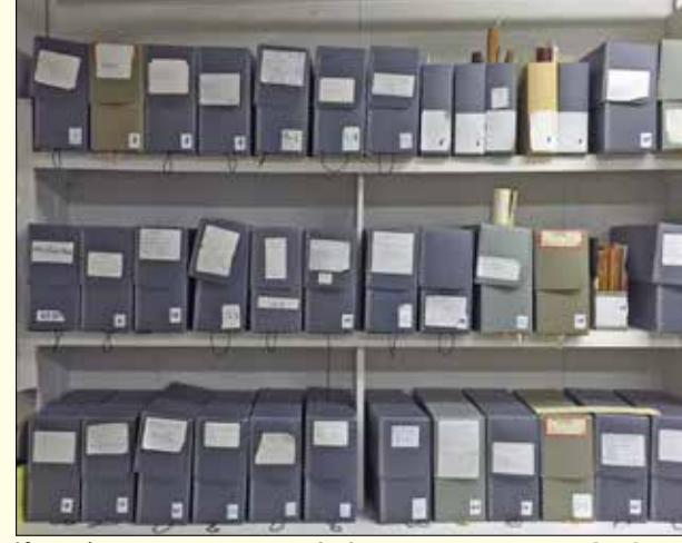
If you've never ventured downstairs to our Archives in the Civic Center, this is just a small portion of the Society's collection of photographs, letters, documents and ephemera. Some of us are here on most Mondays and Thursdays, 10-12. Drop down and see what we have!