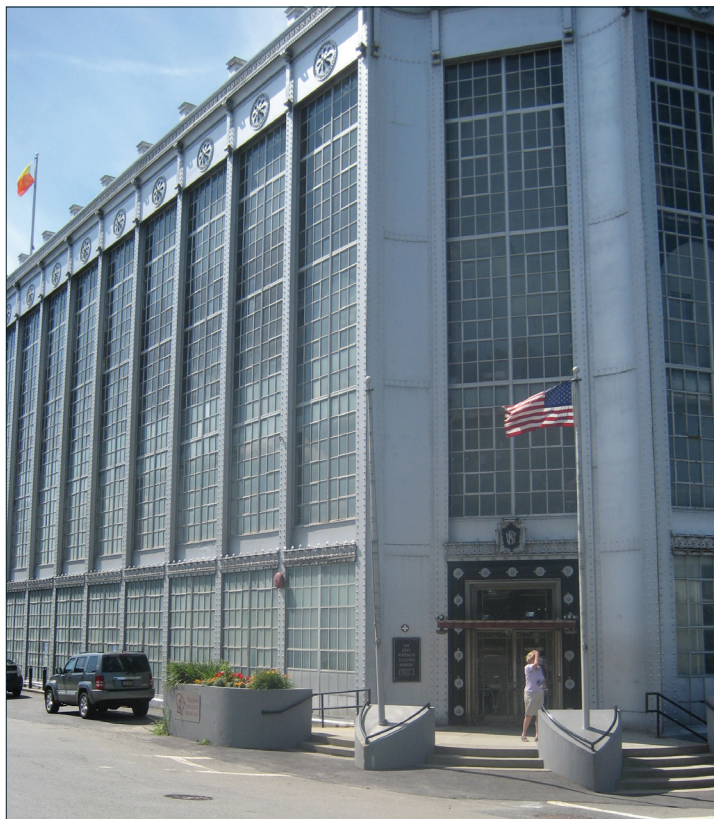
The distinctive art-deco facade of the Higgins Armory Museum.

We'll plan to arrive at the Museum by 2:15. There will be a presentation at 2:30 then we'll be on our own until closing time at 4 pm (gift shop open to 4:30 pm in case you want to buy full body armor). Reservations are necessary. The cost will be $5 per person (the Society will pick up the remaining $2 of the $7 group rate). You can pay on the day itself or mail a check to the Jaffrey Historical Society, 40 Main Street, Jaffrey, NH 03452. In any event, let us know if you plan to come. (See further details on the back page.)