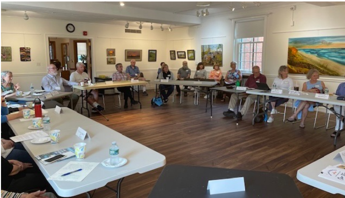
Members of the HSCC Roundtable met at the JHS in June.