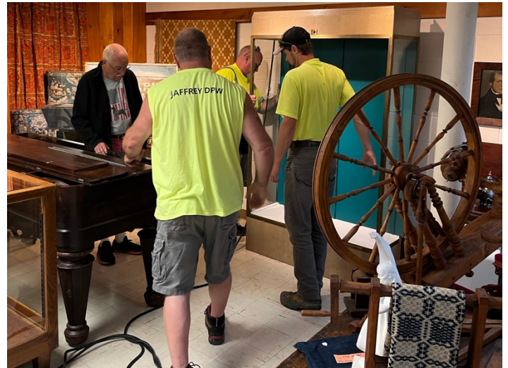
Jaffrey DPW employees helped move two large display cases from the Library to the JHS on June 30. Thank you, DPW!

The Library recently acquired a grant to completely digitize the Amos Fortune collection – soon the manumission papers, deeds, records, and other miscellaneous papers will be accessible in digital form all over the world! To that end, Amos Fortune's lantern and tools have been returned to us, and they have also given us possession of Amos Fortune's own pocket compass. These will also be displayed in our collection – perhaps in the SECOND display case the library has thoughtfully given us! In one remarkable month we received 22 carved birds, two beautiful display cases, and Amos Fortune's compass. We are proud to be the guardians of Jaffrey's history!