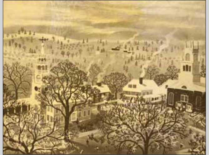
A winter scene in Jaffrey Center with the Meetinghouse and the Brick Church. The date and artist are unknown. 🐾